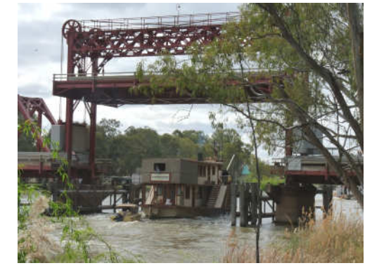
Amphibious passing under the Paringa lift bridge, just before Renmark.