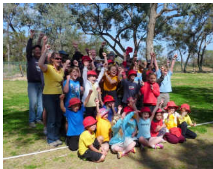
The triumphant Cadell Tug-O-War team. Well done guys, but we'll be back!