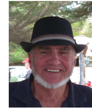
Goolwa Riverboat Centre.

Things at the centre are moving along quite nicely, with the wind of late creating a few issues because of all the leaks in our shed, and depositing a lot of dust on stock and the floors. Thank you to all the 'Sadies' that are on top of it and are doing their best to always put our best side forward. The visitor numbers are increasing slowly with a bit of a hiccup with the Oscar up river. People do actually come in and ask where the boat is so I think in the future we will address this a bit better, but my answer in jest is to tell them that it sank overnight and I am waiting for the salvage people. It gets the visitors smiling! The Oscar took a variety of souvenirs on its trip to Chowilla and sold quite a bit which helps toward future restocking. This is another area that we need to look at for future trips. We did try something new but it proved not to be successful.