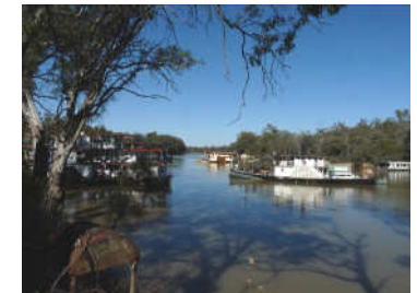
Oscar and Amphibious rafting up at Chowilla