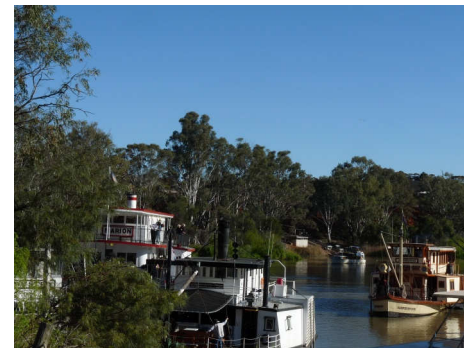
Boats rafted up at Wilkadene