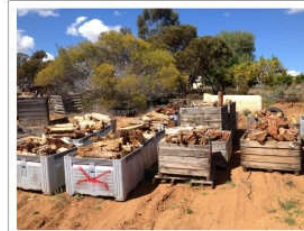
Wood at Doug's