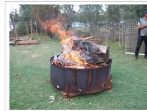
Dougs outdoor heater