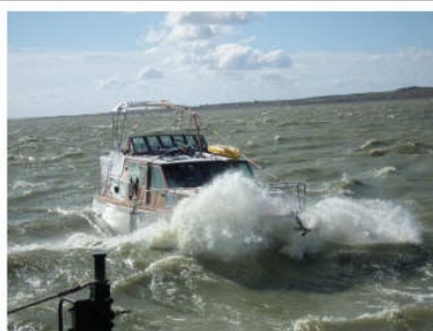
Blythe Spirit moves out of our lee protection and takes one.